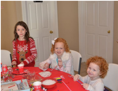
Children making ornaments